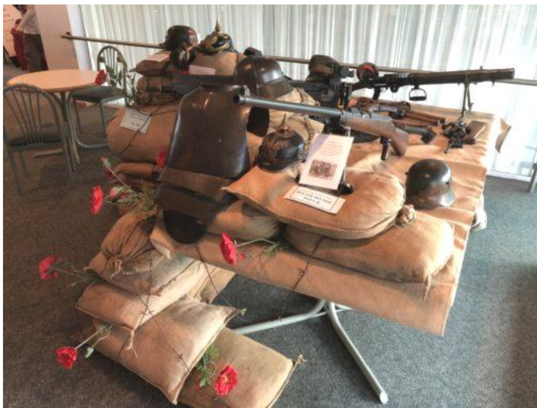
Winning 2018 Public Choice Best Display – German WWI trench scene containing Maxim 08, 08/15, anti tank gun and captured British Lewis Gun