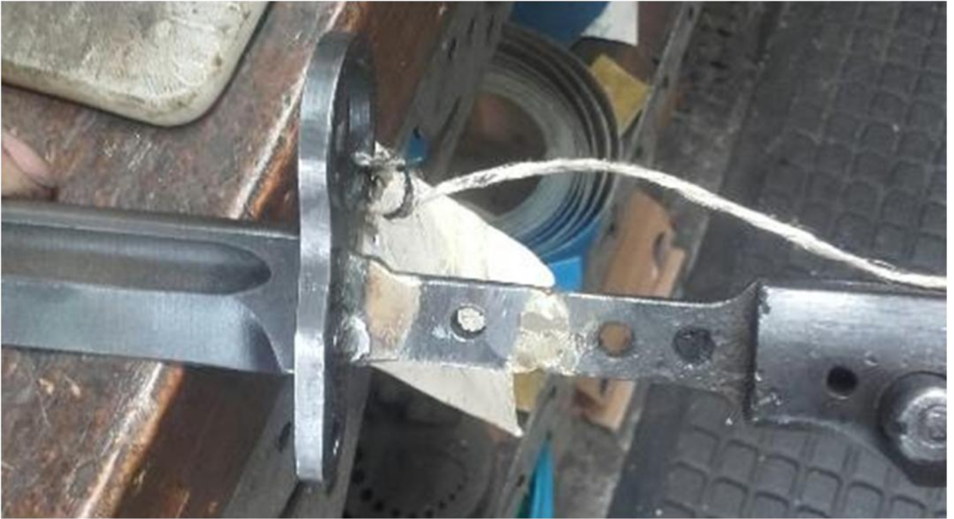
Fake No. 5, Mk. 1 Bayonet, with grips removed

You can see from the photo the L1A2 blade has been brazed to the tang / pommel of a No. 5 bayonet. In this case the crosspiece has been put back on the wrong way around with the chamfer facing forward rather than backwards. It might seem unimportant, but the chamfer is there to aid in slipping the muzzle ring onto the front of the flash eliminator of the No. 5 rifle or positioning lug on the L2A3 Sterling SMG.