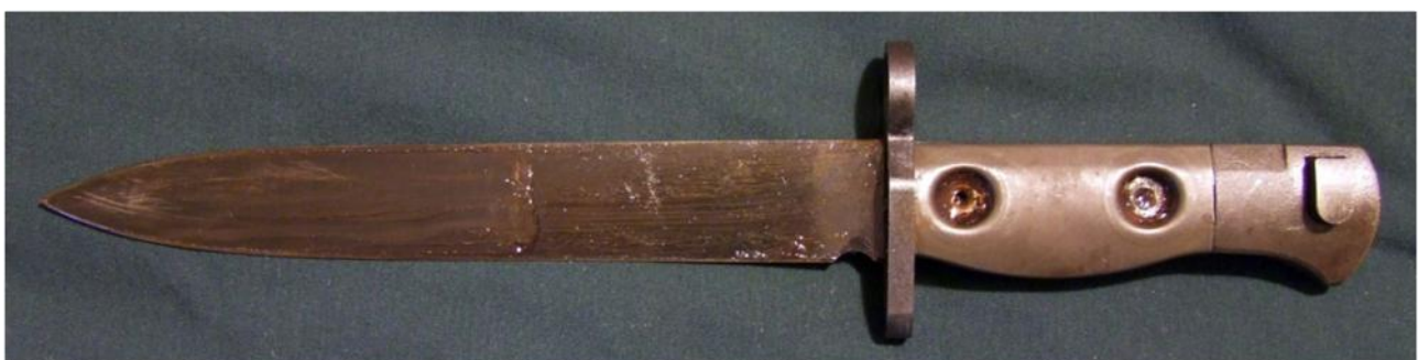
Fake "NZ Fighting Knife"

As with any manufacturing there is always a signature with the way its been made, so too if seems with the fake No. 5 bayonets. The mistakenly reversed crosspiece is also found on another 'Fake' bayonet/knife which appeared recently in New Zealand. That is the 'NZ Fighting Knife/bayonet' which looks like a L1A2 bayonet but with a very thin blade. These bayonet/knives are made using the thinned Malaysian No. 5 blade grafted to the crosspiece, grips and pommel of an Australian L1A2 Bayonet. Because the grips are riveted in place you can't see the tang, but I suspect it will look like the Fake No. 5 tang shown above. Common-sense says both come from the same source.