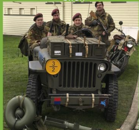
WWII Paratrooper Living History Display with Jeep, PIAT, Flame Thrower and M4V Sten Guns

Saturday, July 20, 2019 9am to 4pm Riccarton Park Raceway ChCh