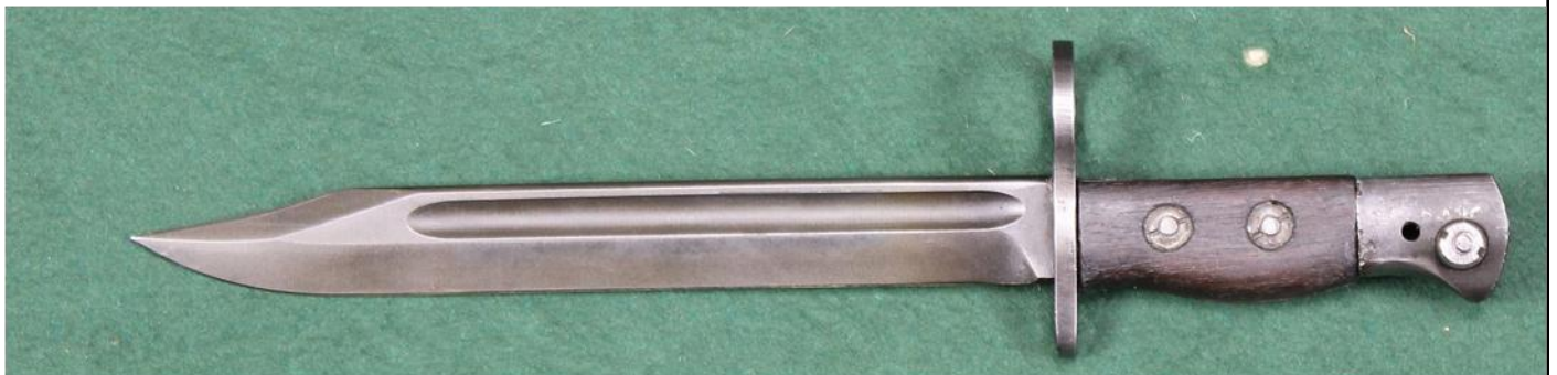
Fake No. 5, Mk. 1 Bayonet

Move forward to 2018, I was cataloguing some items for Militaria Auction and was handed a No. 5 Bayonet to catalogue, I removed the scabbard and low and behold what did I see. An L1A2 Bayonet blade fitted to No. 5 crosspiece, grips and pommel.